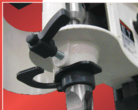
Built in chisel-to-bit spacer