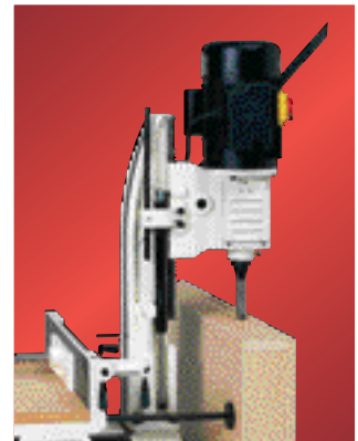
Work in a 180° tilted condition