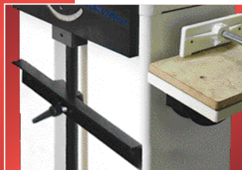
Easy mortising of door locks and wooden panels on lower work support